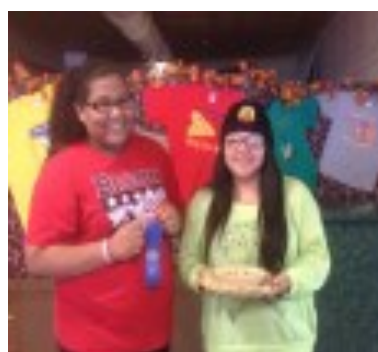
Fifth Hour Group (below)