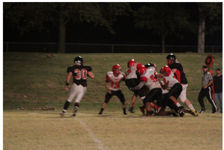
The Bison defense stops the Macomb Hornets