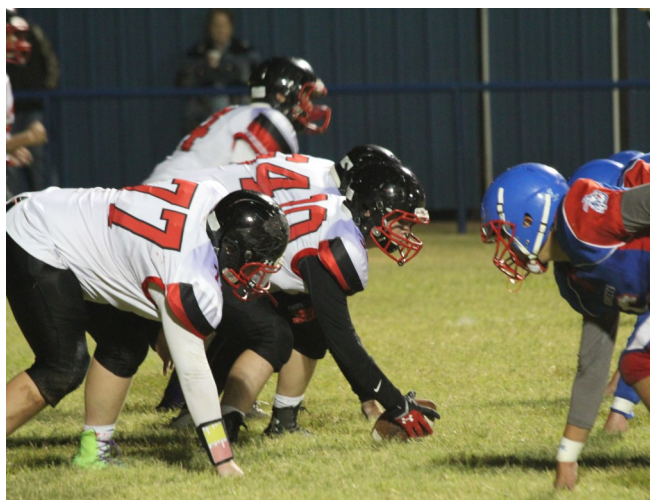
Geary's offensive line ready for the next play.