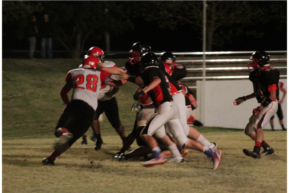
The Bison defense moves in for the tackle

yards for a TD only to have it called back on a penalty. After a couple of nice runs by Bates and Shawnee, Glasgow took a 44 yard scramble in for a touchdown, the point after failed, and that made the score 34-6. The kickoff to Macomb went out of bounds, and they took over on their 35 yard line. After two plays that netted 20 positive yards, the Hornets went around left end for a 45 yard touchdown run to make the score 34-12 at the half.